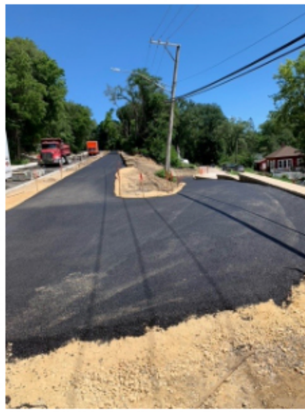
Shared Path Paving Construction