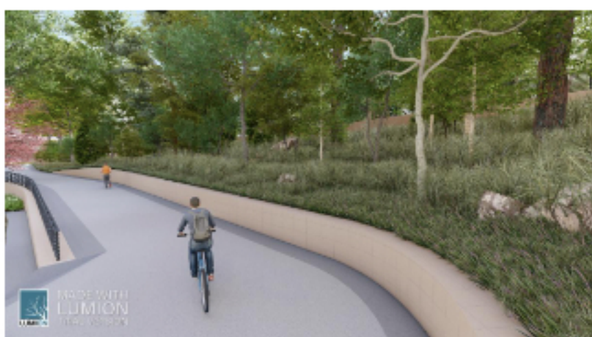
Illustrations of North Main Street roundabout and Harrison Street bike path.