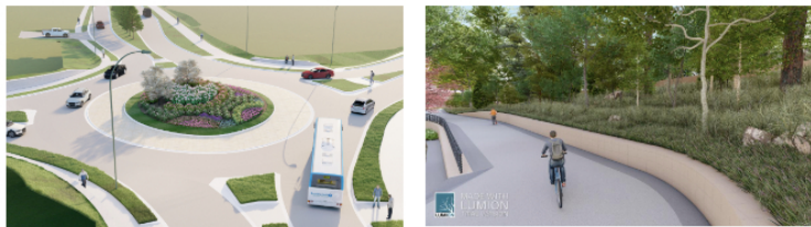
Illustrations of North Main Street roundabout and Harrison Street bike path.

An extension of the Old Town Algonquin project, Around and About Main Street will improve traffic flow and safety for road users of N. Main Street.