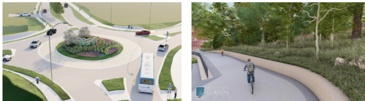
Illustrations of North Main Street roundabout and Harrison Street bike path.

An extension of the Old Town Algonquin project, Around and About Main Street will improve traffic flow and safety for road users of N. Main Street.