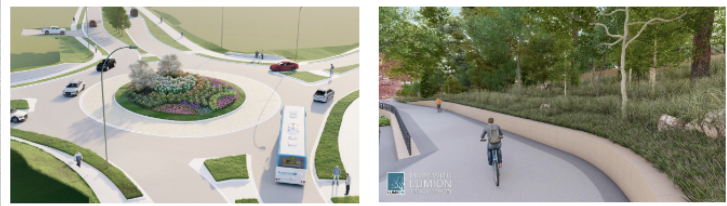
Illustrations of North Main Street roundabout and Harrison Street bike path.

An extension of the Old Town Algonquin project, Around and About Main Street will improve traffic flow and safety for road users of N. Main Street.