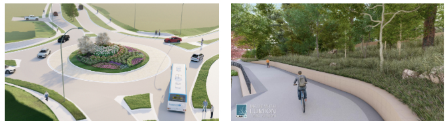
Illustrations of North Main Street roundabout and Harrison Street bike path.

An extension of the Old Town Algonquin project, Around and About Main Street will improve traffic flow and safety for road users of N. Main Street.