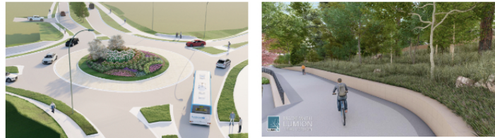
Illustrations of North Main Street roundabout and Harrison Street bike path.

An extension of the Old Town Algonquin project, Around and About Main Street will improve traffic flow and safety for road users of N. Main Street.