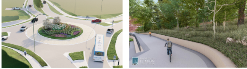
Illustrations of North Main Street roundabout and Harrison Street bike path.

An extension of the Old Town Algonquin project, Around and About Main Street will improve traffic flow and safety for road users of N. Main Street.