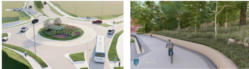
Illustrations of North Main Street roundabout and Harrison Street bike path.

An extension of the Old Town Algonquin project, Around and About Main Street will improve traffic flow and safety for road users of N. Main Street.