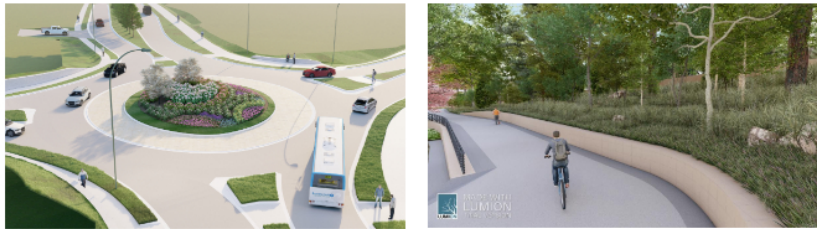
Illustrations of North Main Street roundabout and Harrison Street bike path.

An extension of the Old Town Algonquin project, Around and About Main Street will improve traffic flow and safety for road users of N. Main Street.