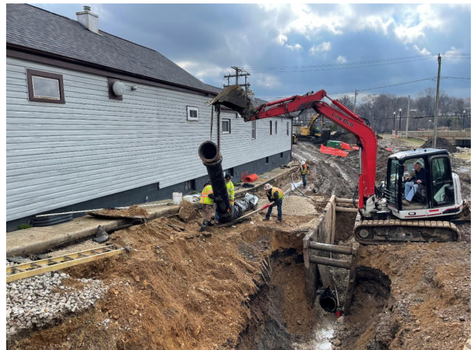
Water Main Installation

Over the next few weeks, crews will continue water main construction and work behind the Historic Village Hall.