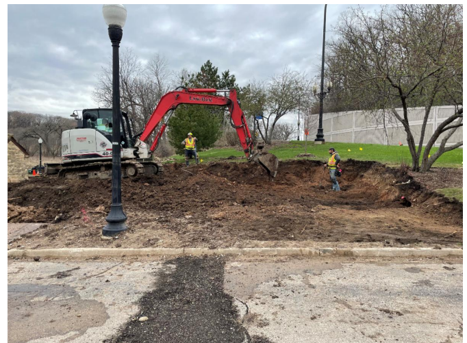
Work Behind Historic Village Hall