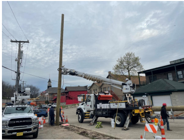
Utility Pole Installation

Over the next few weeks, ComEd crews will install all new cable and make connections into the transformers located in the 111 S. Jefferson Street and 100 S. Main Street parking lots.