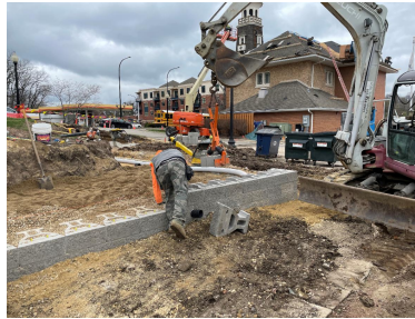
Block Wall Construction