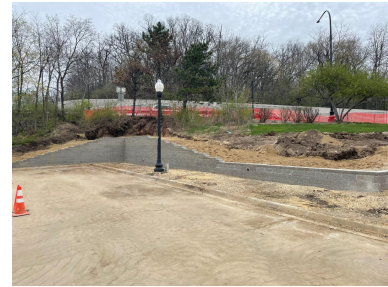
Completed Block Wall