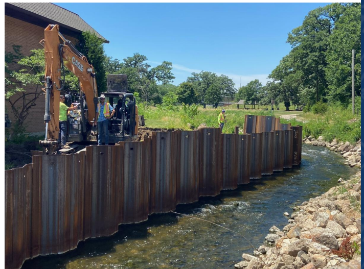
Cofferdam in Crystal Creek

Utility companies will also continue working to transfer existing customers to the new infrastructure on S. Harrison Street.