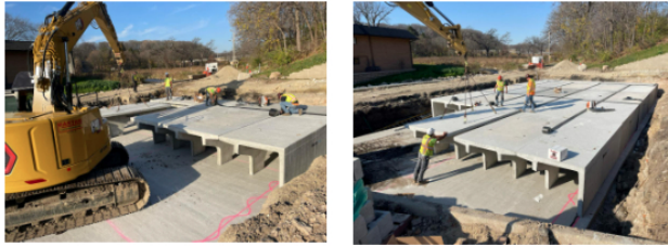
Storm Trap Construction

Over the next few weeks, the contractor will complete construction of the south abutment for the bridge. The contractor also plans to complete grading for the new sidewalk and curb as well as the storm sewer work at Historic Village Hall.