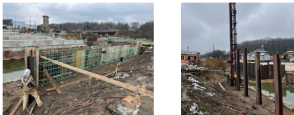
Harrison Street Bridge Abutment Reinforcement Bars and Piles