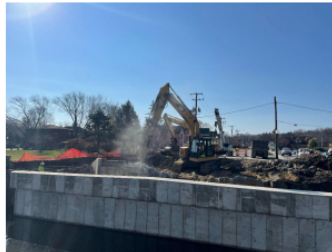
Harrison Street Bridge Demolition