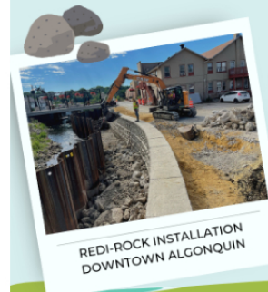
REDI-ROCK INSTALLATION DOWNTOWN ALGONQUIN

Redi-Rock is a precast modular block retaining wall system. The Redi-Rock retaining wall system uses massive one ton blocks made of concrete. These walls are known to perform against freeze thaw cycles and record-setting storms.