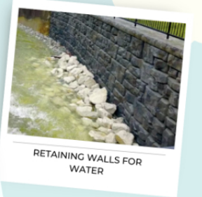
RETAINING WALLS FOR WATER