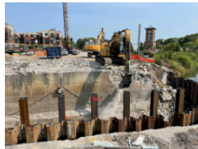
Abutment Wall Demolition

Next week, the contractor will complete framing and install rebar for the north abutment and center pier at the Harrison Street bridge. The contractor also plans to pour the footing and begin installation of the new Redi Rock retaining wall on the north side of Crystal Creek.