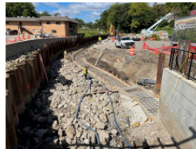
Redi Rock Framing