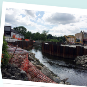
COFFERDAM BUILT AT MAIN STREET