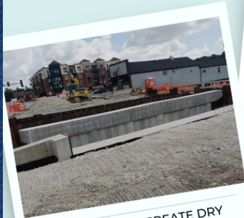
COFFERDAMS CREATE DRY CONSTRUCTION WORK AREAS

a watertight enclosure pumped dry to permit construction work below the waterline, as when building bridges