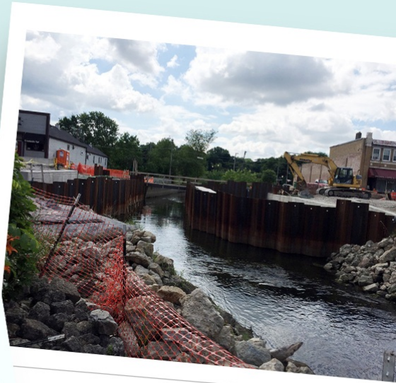
COFFERDAM BUILT AT MAIN STREET