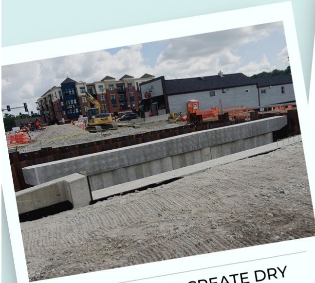
COFFERDAMS CREATE DRY CONSTRUCTION WORK AREAS

a watertight enclosure pumped dry to permit construction work below the waterline, as when building bridges