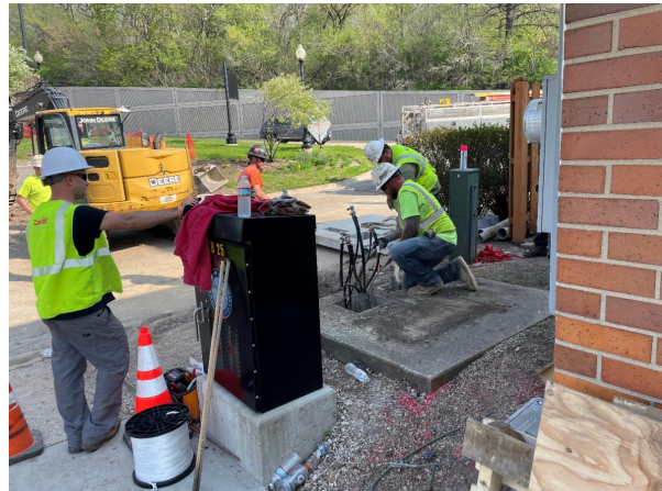
ComEd crews splicing cable at the transformer