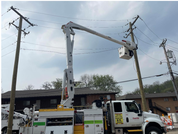
ComEd Aerial Crews

Over the next few weeks, ComEd underground and aerial crews will install all new primary cable and splice cable into the transformers on S. Harrison Street. The Village's contractor will also install the new 6" water main extension through the 111 S. Jefferson Street parking lot.