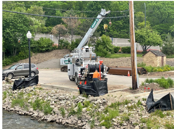
AT&T Cable Work