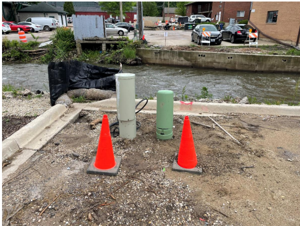
Comcast and AT&T Cable Work

The utility companies will also transfer all existing costumers on the west side of Main Street to the newly installed service infrastructure and install new cable and pedestals on S. Harrison Street.