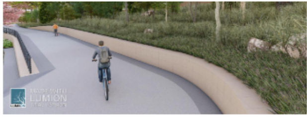
Illustrations of North Main Street roundabout and Harrison Street bike path.